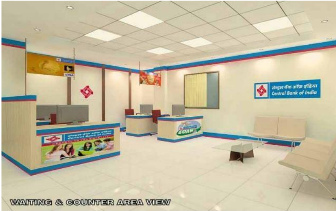
WAITING & COUNTER AREA VIEW