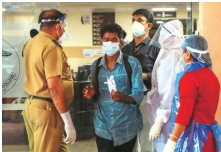
Health workers and security personnel at the emergency ward of a medical college amid an outbreak of Nipah virus, in Kerala's Kozhikode on Friday.